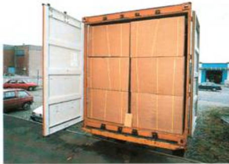
Fig. 17: DEGESCH PLATE: placed inside a container

phosphide, reacts with atmospheric water to produce hydrogen-phosphide gas. This gas is known as phosphine. Phosphine is a colorless gas with an odor that smells different to different people. The odor is often described as similar to garlic, commercial carbide, or decaying fish.