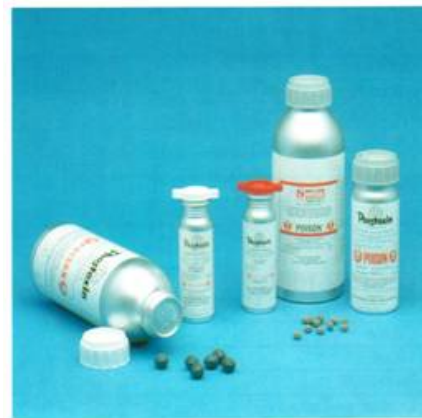
Fig. 3: DEGESCH PHOSTOXIN TABLETS (round form) and PELLETS; made of aluminium phosphide bulk packaged in resealable flasks

fumigants can be used effectively for warehouse and processing plant fumigations.